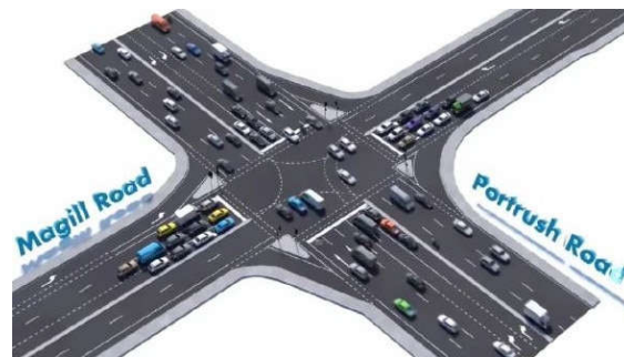
📍 The State Government will acquire 47 properties for the Portrush and Magill Rd intersection upgrade.

“It’s backwards thinking about how to deal with traffic congestion. We shouldn’t be doing it.”