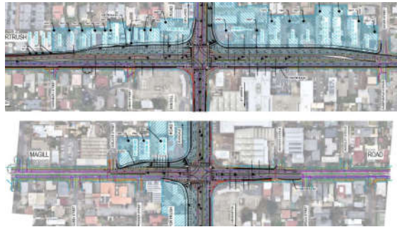
Two images highlighting properties to be demolished for the upgrade. The top image is Portrush Rd running horizontally. The bottom is Magill Rd running horizontally.

Some properties on the northern side of Magill Rd, between Portrush Rd and Adelaide St, will also need to be acquired.